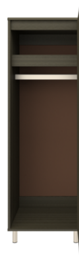
Model: A2WR01R 23.75W 23D 71H

Taking on a new twist from an old classic, the Atlanta II re-invents itself by adding feet for a wonderful new design with tried and true appeal. Cleaning and maintenance are simple and easy when case goods are elevated. Available with or without contrasting edges as well as custom color combinations.